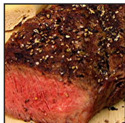
Top Sirloin Steak 1 Pound