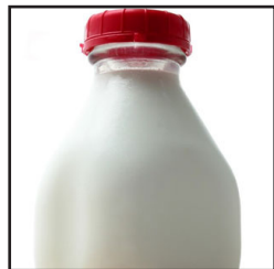
Milk 1 Gallon, Fat Free