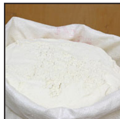
Flour 5 Pounds