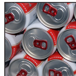
Beer 6-Pack Cans