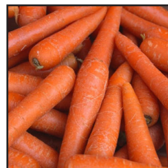
Fresh Carrots 5 Pounds