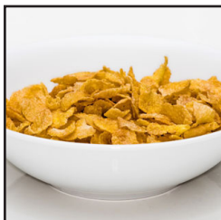
Cereal 18 Ounce Box