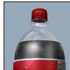
Soda Two Liter Bottle