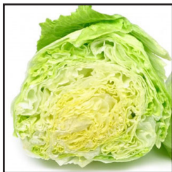
Lettuce 1 Head (2 Pounds)