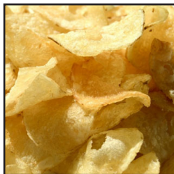
Potato Chips Lays Classic, 10.5 oz