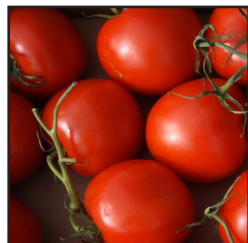
Tomatoes 1 Pound