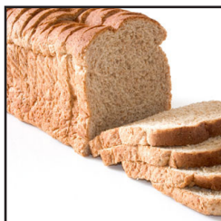
Bread 1 Pound