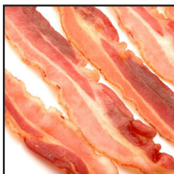
Bacon 1 Pound

According to USDA, off farm costs including marketing, processing, wholesaling, distribution and retailing account for more than 80 cents of every food dollar spent in the United States.