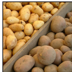
Fresh Potatoes Russet, 5 Pounds